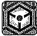
IMAGINIT Utilities for Revit

Enhance your Autodesk software and drive greater efficiency across your entire organization with these time saving tools from IMAGINIT's group of professional programmers.