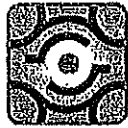
IMAGINIT Clarity Security