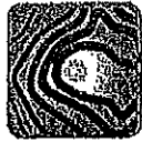
IMAGINIT Utilities for Civil 3D